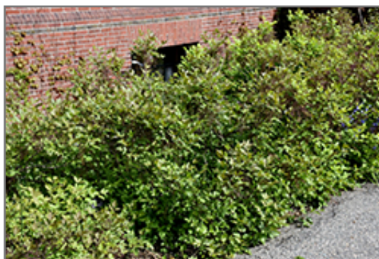
Shrub Yellowroot