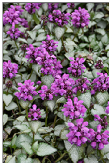
Purple Dragon Spotted Dead Nettle flowers

Purple Dragon Spotted Dead Nettle is recommended for the following landscape applications;