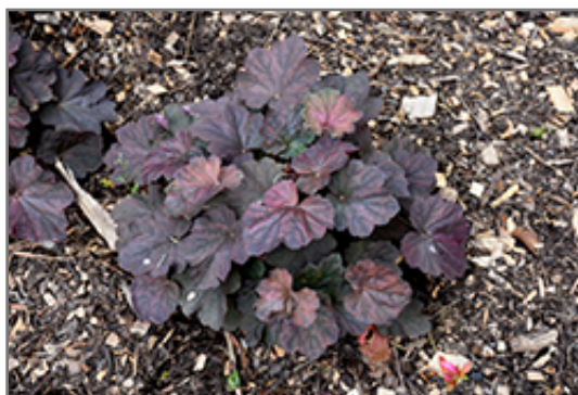
Mocha Coral Bells