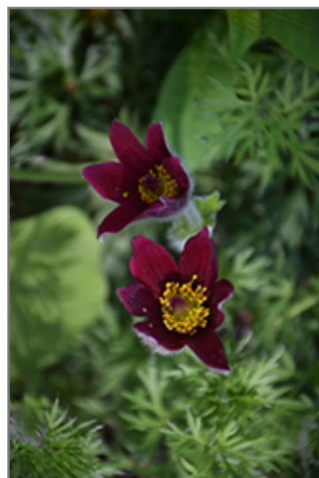
Red Pasqueflower flowers