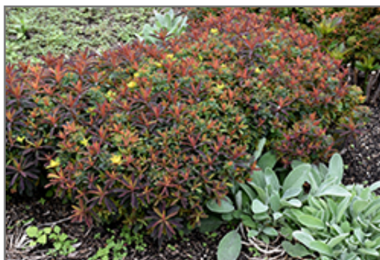
Bonfire Cushion Spurge