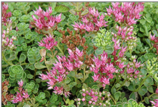
John Creech Stonecrop flowers

John Creech Stonecrop is recommended for the following landscape applications;