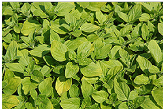
Golden Oregano foliage

This is an herbaceous evergreen perennial herb with a mounded form. It brings an extremely fine and delicate texture to the garden composition and should be used to full effect. This is a relatively low maintenance plant, and should be cut back in late fall in preparation for winter. It is a good choice for attracting butterflies to your yard, but is not particularly attractive to deer who tend to leave it alone in favor of tastier treats. It has no significant negative characteristics.