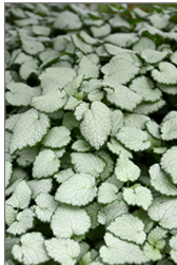
Red Nancy Spotted Dead Nettle foliage

Red Nancy Spotted Dead Nettle is a fine choice for the garden, but it is also a good selection for planting in outdoor pots and containers. Because of its spreading habit of growth, it is ideally suited for use as a 'spiller' in the 'spiller-thriller-filler' container combination; plant it near the edges where it can spill gracefully over the pot. Note that when growing plants in outdoor containers and baskets, they may require more frequent waterings than they would in the yard or garden.