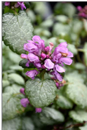
Red Nancy Spotted Dead Nettle flowers