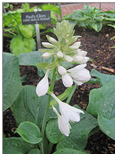
Elegans Hosta flowers