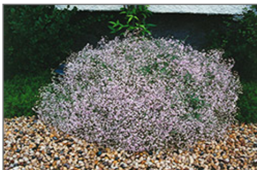
Pink Fairy Baby's Breath in bloom