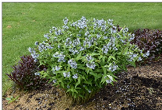
Blue Star Flower in bloom