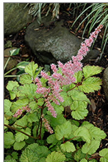
Amber Moon Chinese Astilbe flowers