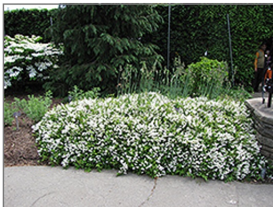
Nikko Deutzia in bloom

Nikko Deutzia is recommended for the following landscape applications;