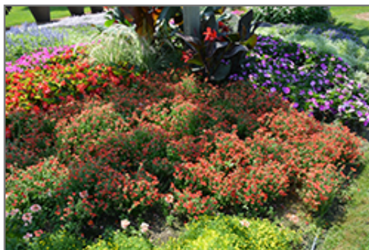
Sunsatia Cranberry Nemesia in bloom