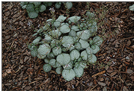
Emerald Lace Plectranthus in bloom