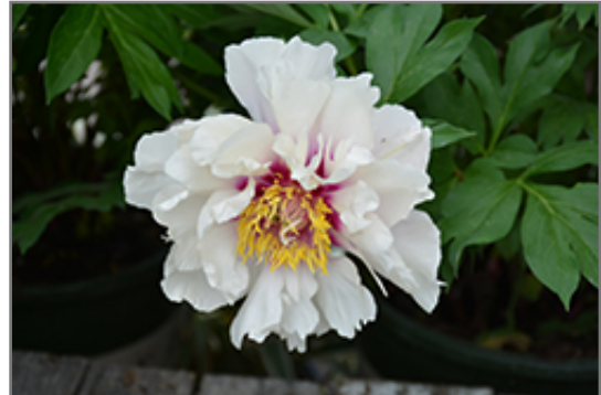
Cora Louise Peony flowers