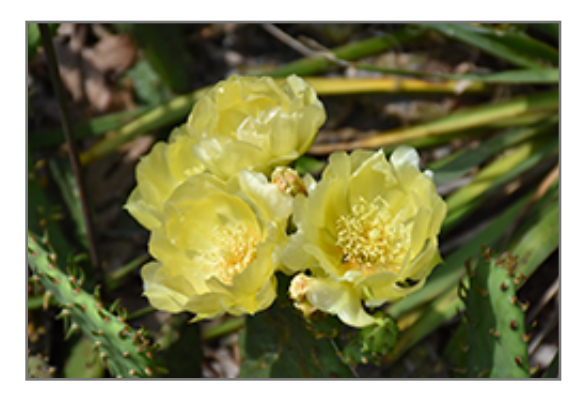
Prickly Pear Cactus flowers