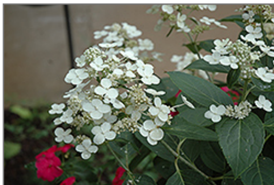
Dharuma Hydrangea flowers