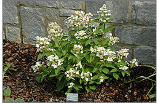
Dharuma Hydrangea in bloom

This shrub does best in full sun to partial shade. It prefers to grow in average to moist conditions, and shouldn't be allowed to dry out. It is not particular as to soil type, but has a definite preference for acidic soils. It is highly tolerant of urban pollution and will even thrive in inner city environments. Consider applying a thick mulch around the root zone in winter to protect it in exposed locations or colder microclimates. This is a selected variety of a species not originally from North America.