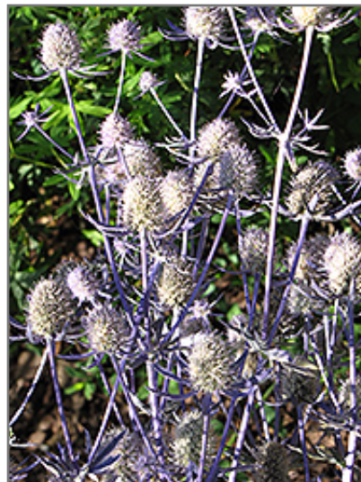
Jade Frost Variegated Sea Holly flowers

Jade Frost Variegated Sea Holly is a fine choice for the garden, but it is also a good selection for planting in outdoor pots and containers. It can be used either as 'filler' or as a 'thriller' in the 'spiller-thriller-filler' container combination, depending on the height and form of the other plants used in the container planting. Note that when growing plants in outdoor containers and baskets, they may require more frequent waterings than they would in the yard or garden.