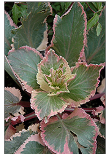
Jade Frost Variegated Sea Holly foliage