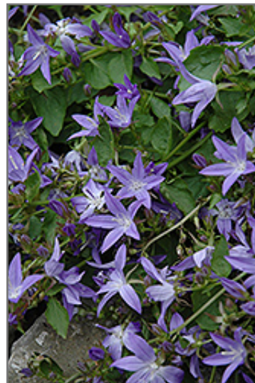
Serbian Bellflower flowers