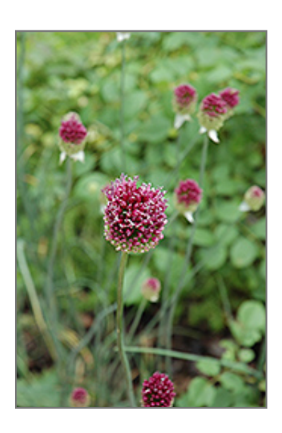
Drumstick Allium flowers

Striking reddish-purple globe flowers emerge from thick strappy green foliage; attracts butterflies; plant close together for a massed effect or plant futher apart among lower growing plants