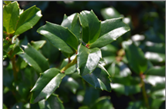
China Boy Meserve Holly foliage