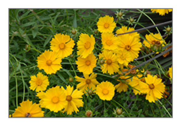
Lanceleaf Tickseed flowers

All this variety needs is well drained soil and lots of sunshine and it will bloom profusely all summer long; a more open and airy form and a wildflower look that blends well in a cottage style garden; when positioning remember flowers follow the sun