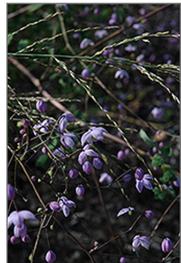
Splendide Meadow Rue flowers