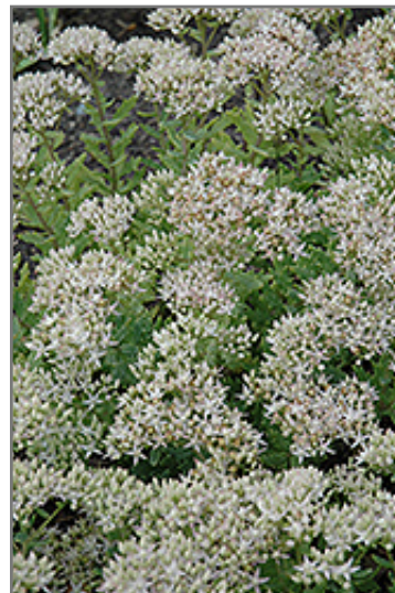
Thundercloud Stonecrop flowers

Thundercloud Stonecrop is a dense herbaceous perennial with a mounded form. Its relatively fine texture sets it apart from other garden plants with less refined foliage.