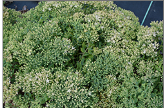
Thundercloud Stonecrop flower buds