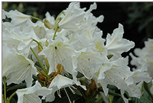
Cunningham White Rhododendron flowers

Cunningham White Rhododendron will grow to be about 6 feet tall at maturity, with a spread of 6 feet. It tends to be a little leggy, with a typical clearance of 1 foot from the ground, and is suitable for planting under power lines. It grows at a slow rate, and under ideal conditions can be expected to live for 40 years or more.