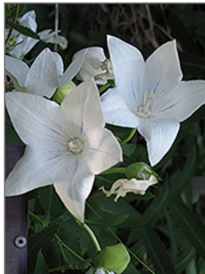
Fairy Snow White Balloon Flower flowers