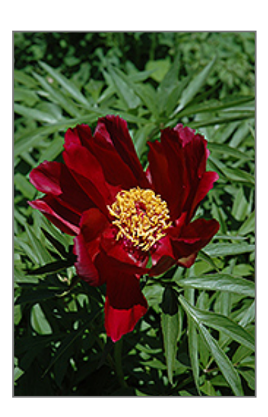
Early Scout Peony flowers

Early Scout Peony features bold lightly-scented crimson cup-shaped flowers with yellow centers at the ends of the stems from late spring to early summer. The flowers are excellent for cutting. Its compound leaves remain dark green in color throughout the season.