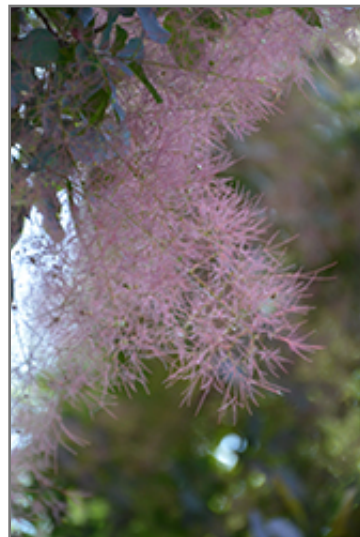
Royal Purple Smokebush flowers

This shrub should only be grown in full sunlight. It is very adaptable to both dry and moist locations, and should do just fine under average home landscape conditions. It is not particular as to soil type or pH. It is highly tolerant of urban pollution and will even thrive in inner city environments, and will benefit from being planted in a relatively sheltered location. This is a selected variety of a species not originally from North America.