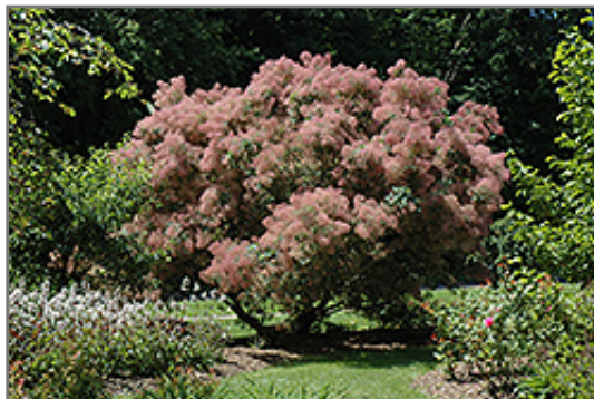
Grace Smokebush in bloom

This shrub will require occasional maintenance and upkeep, and is best pruned in late winter once the threat of extreme cold has passed. Deer don't particularly care for this plant and will usually leave it alone in favor of tastier treats. It has no significant negative characteristics.