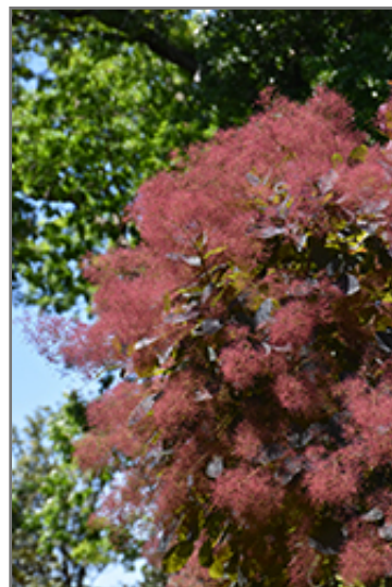
Grace Smokebush flowers