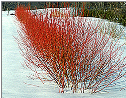
Cardinal Dogwood in winter