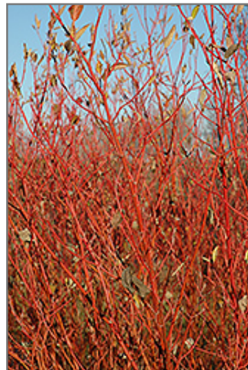
Cardinal Dogwood bark