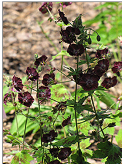
Samobor Cranesbill in bloom

Samobor Cranesbill is recommended for the following landscape applications;