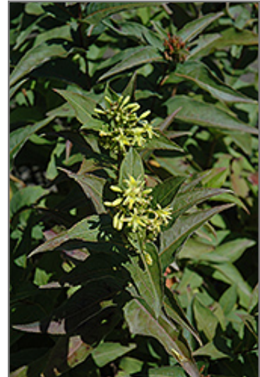
Butterfly Southern Bush Honeysuckle flowers

Butterfly Southern Bush Honeysuckle is recommended for the following landscape applications;