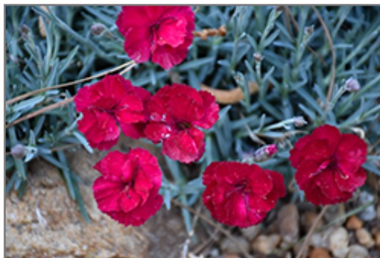
Frosty Fire Pinks flowers