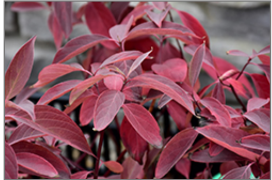
Arctic Fire Red Twig Dogwood in fall

This shrub does best in full sun to partial shade. It is an amazingly adaptable plant, tolerating both dry conditions and even some standing water. It is not particular as to soil type or pH. It is highly tolerant of urban pollution and will even thrive in inner city environments. This is a selection of a native North American species.