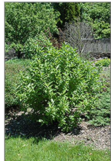
Arctic Fire Red Twig Dogwood