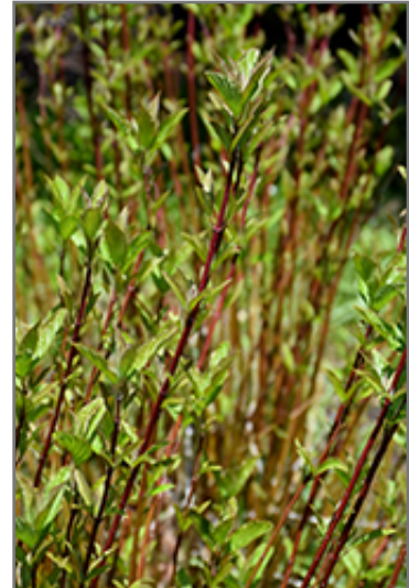
Arctic Fire Red Twig Dogwood stems