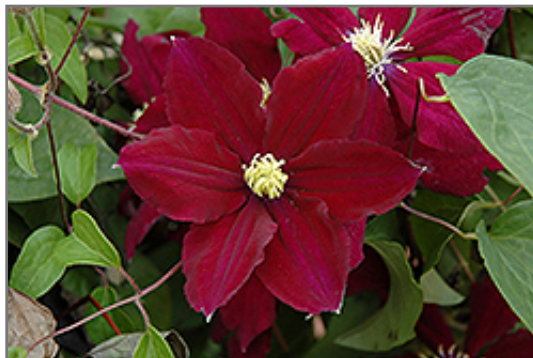
Rosemoor Clematis flowers