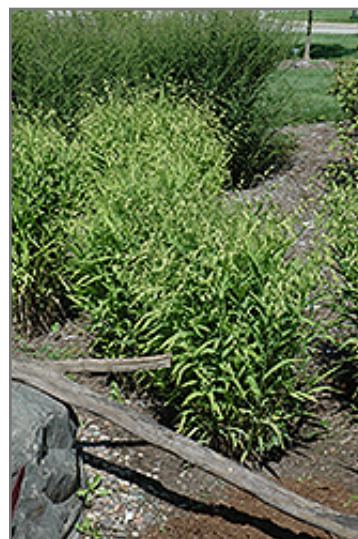
Northern Sea Oats