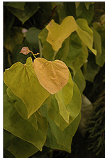
The Rising Sun Redbud foliage