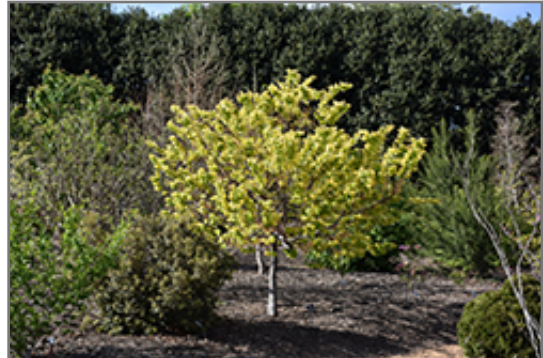
The Rising Sun Redbud in spring

The Rising Sun Redbud will grow to be about 12 feet tall at maturity, with a spread of 8 feet. It has a low canopy with a typical clearance of 3 feet from the ground, and is suitable for planting under power lines. It grows at a medium rate, and under ideal conditions can be expected to live for 60 years or more.