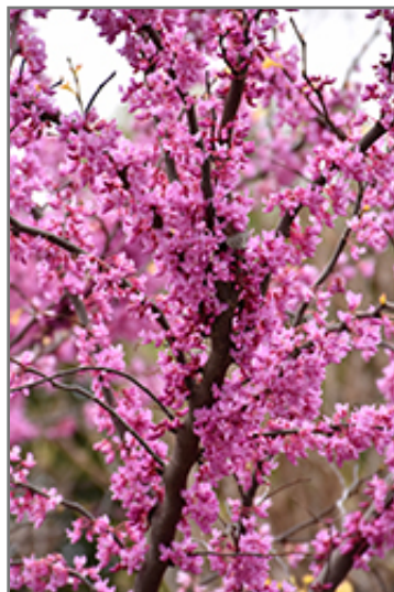
The Rising Sun Redbud flowers