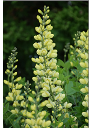
Carolina Moonlight False Indigo flowers

This is a relatively low maintenance plant, and is best cleaned up in early spring before it resumes active growth for the season. It is a good choice for attracting bees and butterflies to your yard. It has no significant negative characteristics.