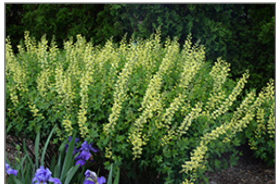
Carolina Moonlight False Indigo in bloom