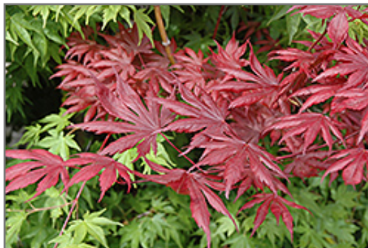
Trompenburg Japanese Maple foliage

This is a relatively low maintenance tree, and should only be pruned in summer after the leaves have fully developed, as it may 'bleed' sap if pruned in late winter or early spring. It has no significant negative characteristics.