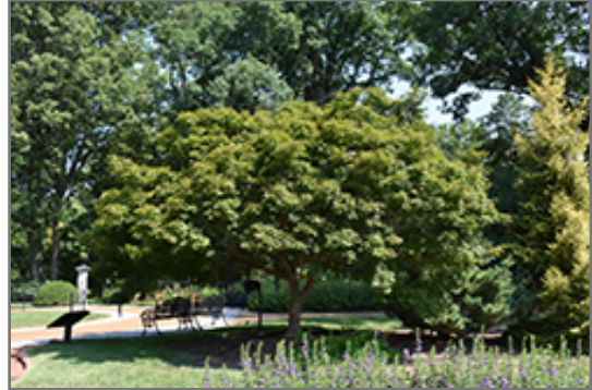
Trompenburg Japanese Maple

This tree does best in full sun to partial shade. You may want to keep it away from hot, dry locations that receive direct afternoon sun or which get reflected sunlight, such as against the south side of a white wall. It prefers to grow in average to moist conditions, and shouldn't be allowed to dry out. It is not particular as to soil pH, but grows best in rich soils. It is somewhat tolerant of urban pollution, and will benefit from being planted in a relatively sheltered location. Consider applying a thick mulch around the root zone in winter to protect it in exposed locations or colder microclimates. This is a selected variety of a species not originally from North America.