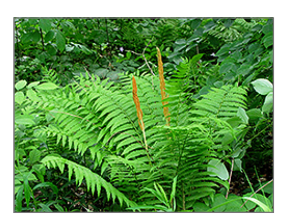
Cinnamon Fern in bloom

Cinnamon Fern is recommended for the following landscape applications;