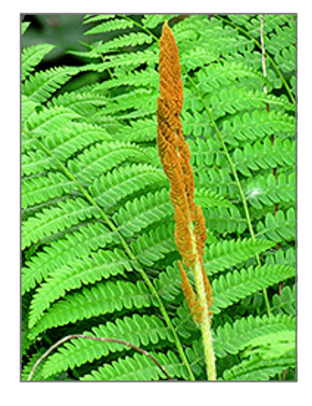
Cinnamon Fern flowers