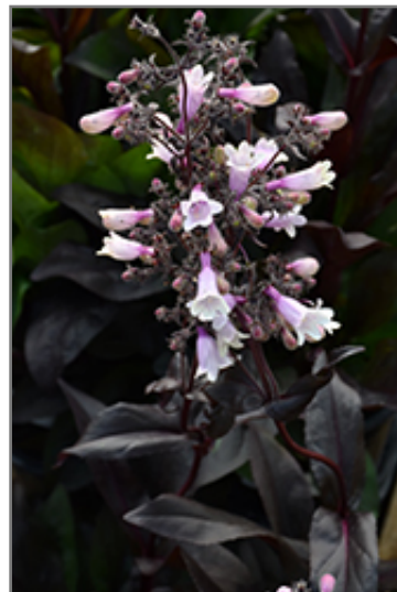
Dark Towers Beard Tongue flowers