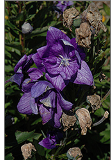
Hakone Double Blue Balloon Flower flowers

Hakone Double Blue Balloon Flower will grow to be about 18 inches tall at maturity extending to 24 inches tall with the flowers, with a spread of 18 inches. When grown in masses or used as a bedding plant, individual plants should be spaced approximately 15 inches apart. It grows at a medium rate, and under ideal conditions can be expected to live for approximately 10 years. As an herbaceous perennial, this plant will usually die back to the crown each winter, and will regrow from the base each spring. Be careful not to disturb the crown in late winter when it may not be readily seen!