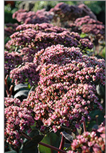
Maestro Stonecrop flowers

This is a relatively low maintenance plant, and is best cleaned up in early spring before it resumes active growth for the season. It is a good choice for attracting bees and butterflies to your yard, but is not particularly attractive to deer who tend to leave it alone in favor of tastier treats. It has no significant negative characteristics.