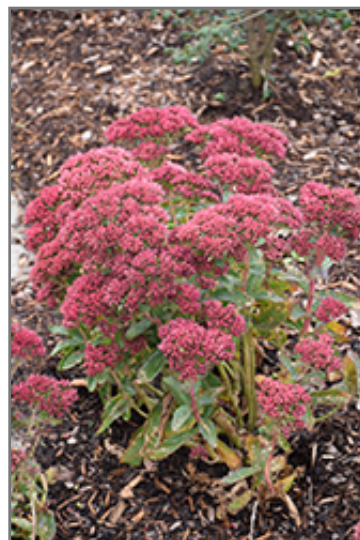
Munstead Dark Red Stonecrop in bloom