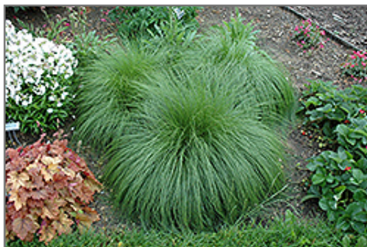
Prairie Dropseed

This is a relatively low maintenance plant, and is best cleaned up in early spring before it resumes active growth for the season. Deer don't particularly care for this plant and will usually leave it alone in favor of tastier treats. It has no significant negative characteristics.