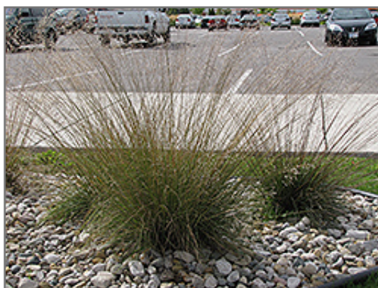
Prairie Dropseed