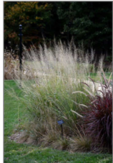
Prairie Dropseed fruit

This plant does best in full sun to partial shade. It is very adaptable to both dry and moist locations, and should do just fine under typical garden conditions. It is considered to be drought-tolerant, and thus makes an ideal choice for a low-water garden or xeriscape application. It is not particular as to soil type or pH, and is able to handle environmental salt. It is somewhat tolerant of urban pollution. This species is native to parts of North America.