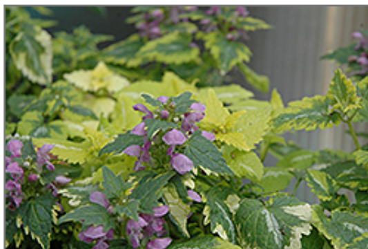
Anne Greenaway Spotted Dead Nettle flowers