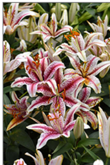
Dizzy Lily flowers