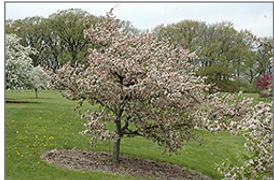
Leprechaun Flowering Crab in bloom