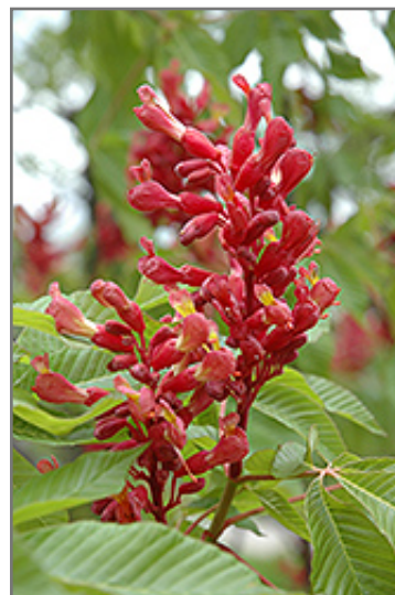
Red Buckeye flowers

Red Buckeye is recommended for the following landscape applications;